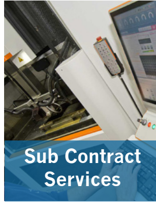
Sub Contract Services