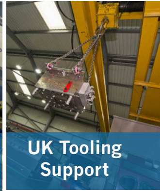
UK Tooling Support